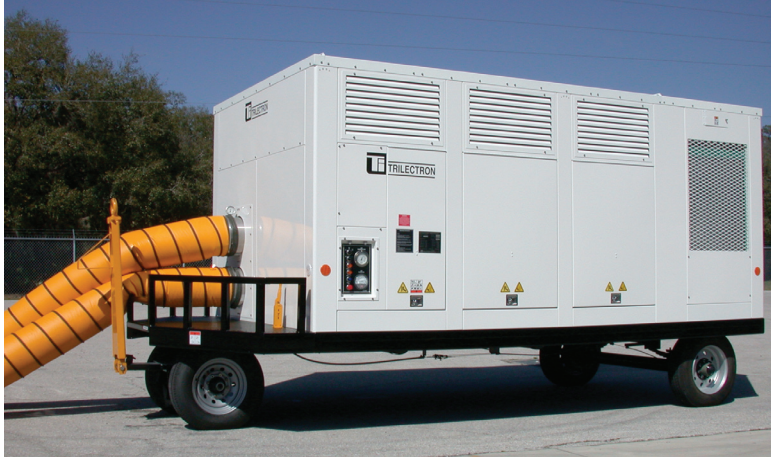
Model DAC90 Trailer Mounted