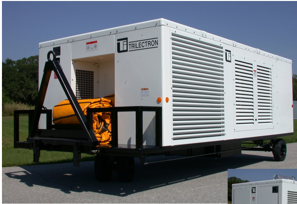
Model DAC30 Trailer Mounted